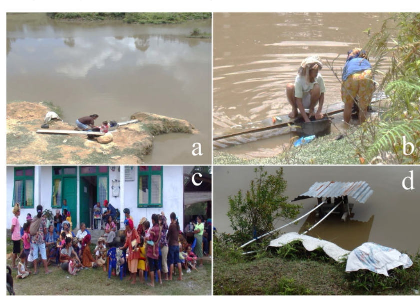
Fig. 2. Pictures showing the use of natural pond water for washing clothes in Ronggurnihuta Subdistrict (a, b) next to a small health center ( Poskesdes ) (c), and an electric pumping system for water at the health center (d). The pond water is used for washing hands, feet, dishes, and clothes and can be contaminated with fecal material.

This work was supported by Grant-in-Aid (for research from 1999 to 2014 from the Japan Society for the Promotion of Science (JSPS), JSPS-Asia/Africa Scientific Platform Funds (2006–2008, 2009–2011) and the