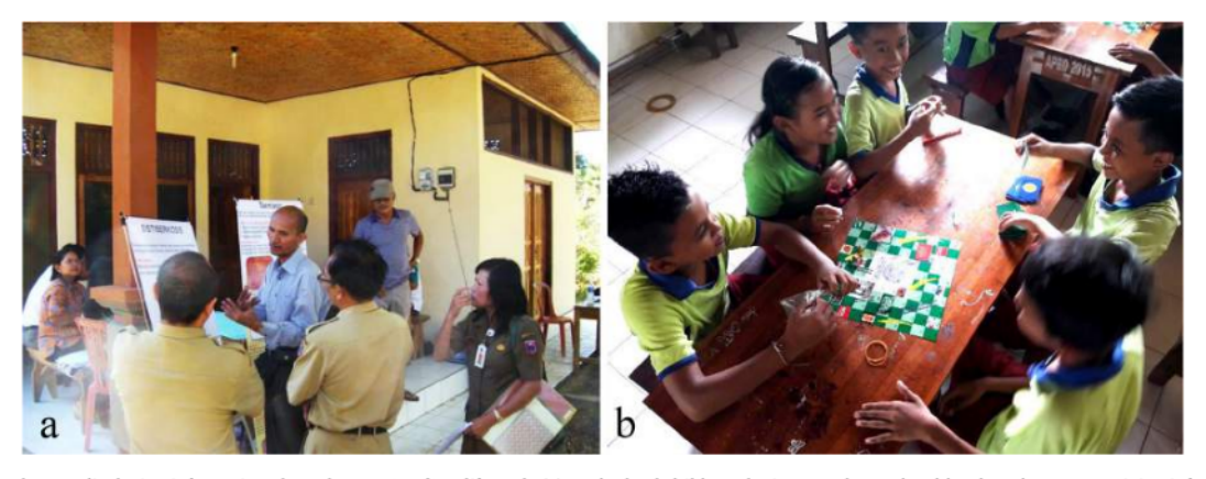
Fig. 2. A banner displaying information about the Taenia solium life cycle (a), and school children playing a Snakes and Ladders board game containing information about T. solium transmission and prevention (Wulanyani et al., 2019) (b).