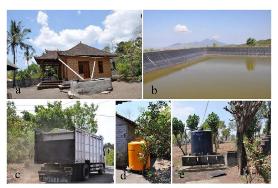
Fig. 4. Images showing rainwater collection by a household (a), a public rainwater collection reservoir (b), a water delivery truck during the dry season (c), a water storage tank at a house (d), and a public water storage tank (e).

Based on recent studies and improved living conditions in Karangasem during the last decade, the goal of eradicating T. solium from Bali is believed to be attainable. While there is cause for optimism in Bali, the four cases of T. solium taeniasis found during 2019–2020 emphasize the need for vigilance to ensure that the parasite is not reintroduced, and any remaining pockets of transmission are destroyed through the implementation of a comprehensive surveillance and control program (Lightowlers, 2010; Wandra et al., 2015; Wulanyani et al., 2019). At this time, it is also not clear how the selling and movement of