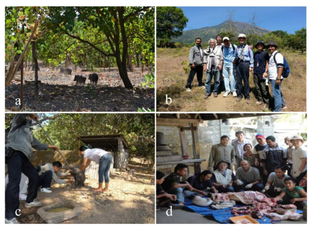
Fig. 3. Images showing the collection of blood samples from pigs to look for cysticercosis in collaboration with the Karangasem District and Kubu Subdistrict Livestock Offices (a, b, c), and necropsy of pigs with cysticercosis used as an opportunity to educate community members about the Taenia solium life cycle and control measures (d).

Kubu subdistrict is located in the Karangasem district of Bali and consists of nine villages (Fig. 1), with each village containing six banjars. A banjar is the smallest administrative unit (sub-village) with 159–165 families and 782–800 inhabitants (Wandra et al., 2006a). The study banjars were selected after identifying a locally acquired ocular cysticercosis case in 2010 and with the recommendations of local health centers. Studies were carried out in the village of Dukuh during January and September of 2011 (3 banjars), in Dukuh during January and